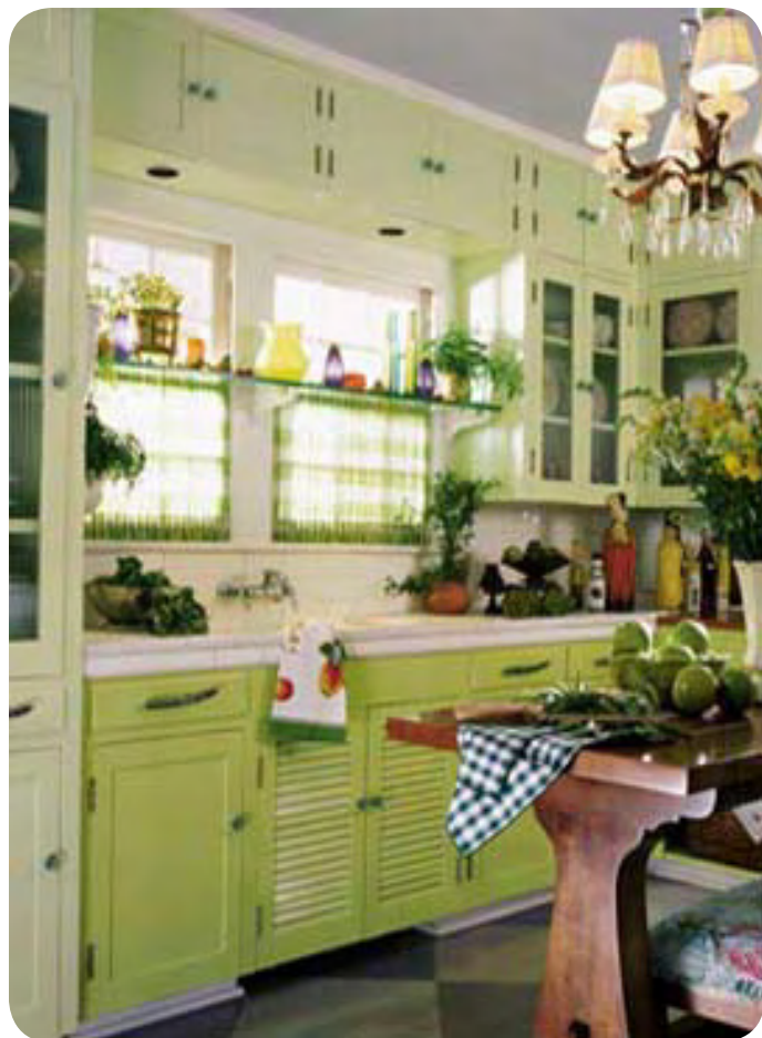
TOP: Two shades of green have been used on wall and floor cabinets. BOTTOM: A pale tangerine creates a colourful and welcoming kitchen.

For the paint you can use a water-based gloss (Prominent Paints Ultra Gloss), a standard enamel paint, or an acrylic paint to which you would apply at least two coats of a water-based varnish to finish. Allow the cabinets to dry overnight before putting everything back together and re-attaching the hardware.